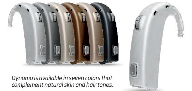
Dynamo is available in seven colors that complement natural skin and hair tones.

Speech Rescue is a unique sound processing feature that captures spoken sound and makes it more understandable. Other power hearing instruments compress sounds in the hearing spectrum. Dynamo with Speech Rescue actually rescues the important speech frequencies that you might otherwise lose. Subtle sounds like "s" and "th" are then repositioned within your individual range of hearing to give you greater access to speech sounds, so you'll be able to better enjoy the rhythm and flow of every conversation.